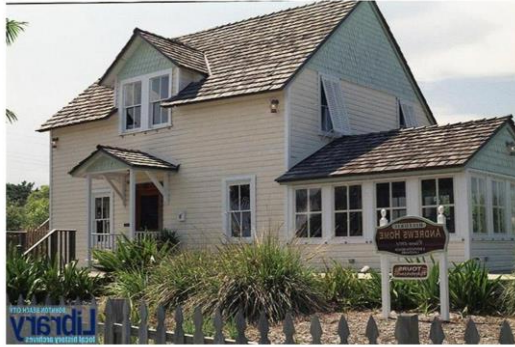
Andrews House, c.2000

The oldest home still standing in Boynton Beach is the Edith Andrews House . It is located at 306 SE First Avenue, Boynton Beach, and is a vital piece of Boynton Beach's architectural and cultural heritage. Sadly, the Andrews House is facing potential demolition by its private owner and is seriously endangered.